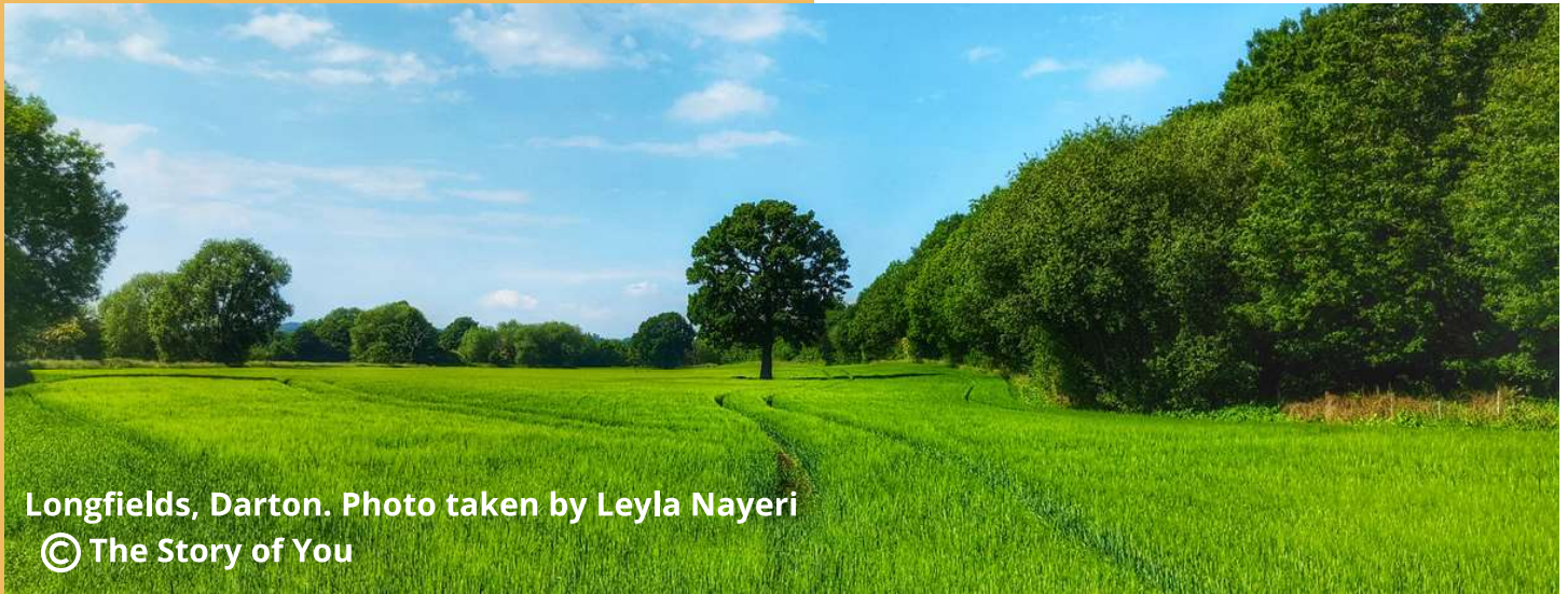
Longfields, Darton.

North Area Council will like to introduce an additional service to help keep the north area clean, green and well-presented.